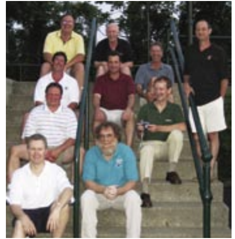
These guys were born to putt! Lambda Chi brothers take a break from the links to pose for a picture.