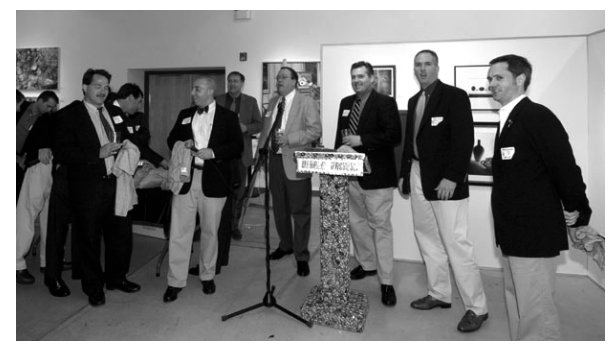
Left: Brothers from the '80s enjoy the Banana Factory Arts Center Gallery

Photo Album Gamma-Psi 1,000th-Member Initiation Ceremony and Reception