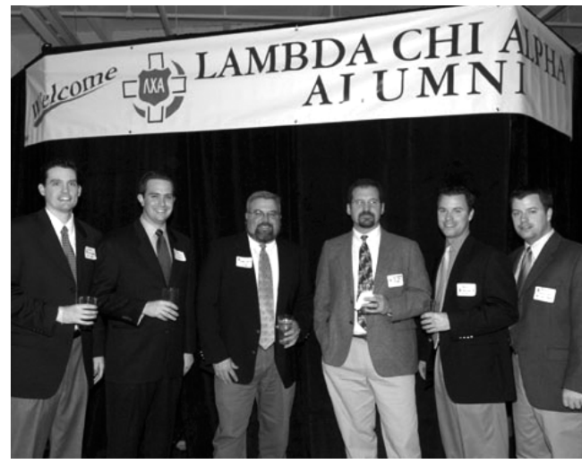
Above: Brothers from the '90s at the reception