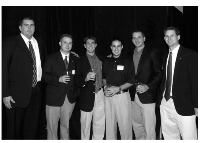
Above: Alumni from '00-'03 in attendance