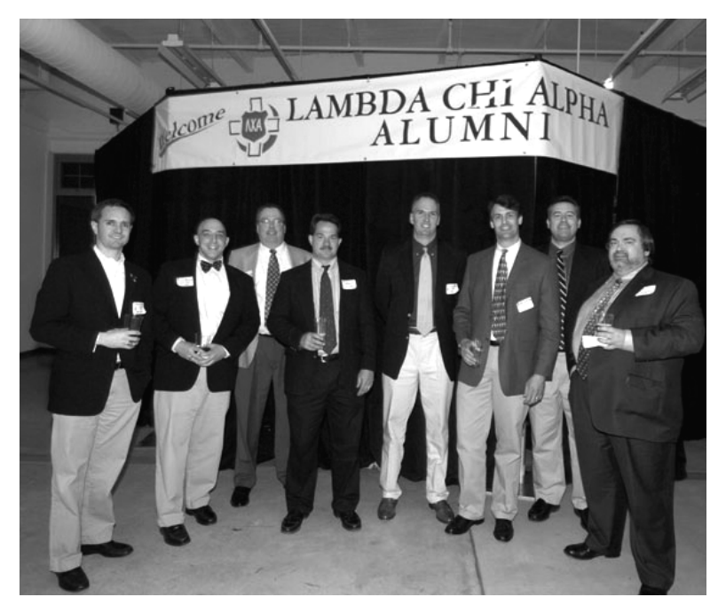
Below: Alumni from the '80s in attendance at the festivities